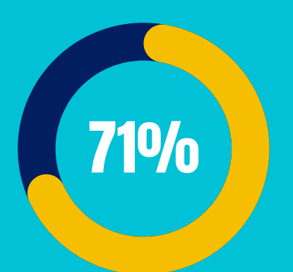
of UK people are not interested in purchasing crypto