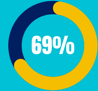
Percentage of UK population who own crypto are males

People who are aware that crypto trading is taxed