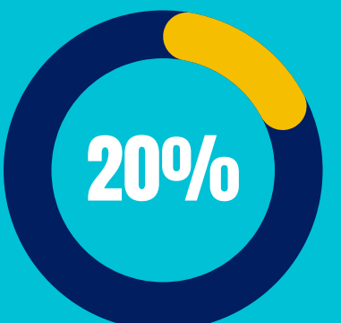
of UK people bought crypto for the first time in 2021