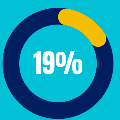
of UK people have bought crypto in the past